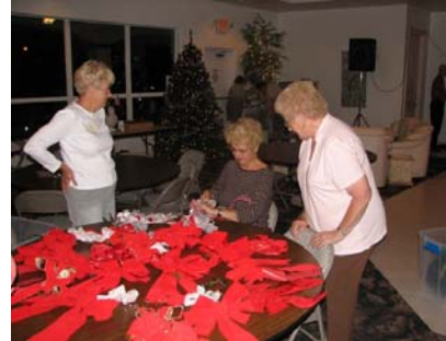
Ribbons, ribbons & more Ribbons. Thanks, gals!

Do you have special news we should know about? Be sure and email me if you do. We want to know about you!